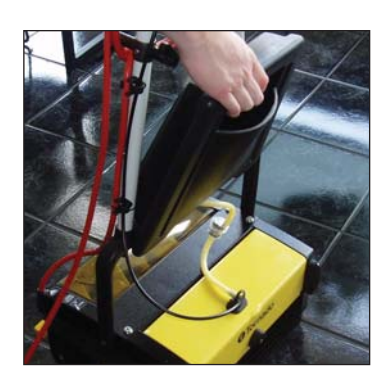
Simple to Use Removable water tanks are easily emptied, rinsed and refilled.